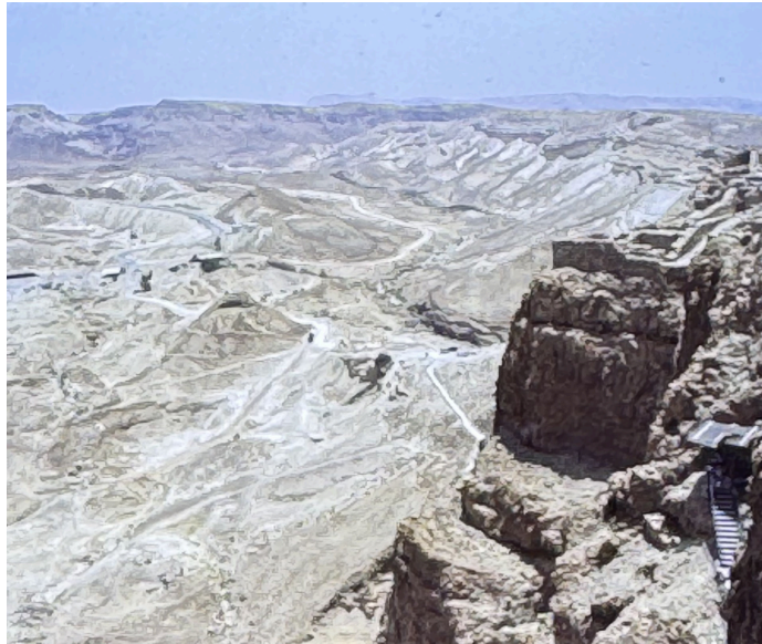
Judean desert - September 1985

“Then Jesus was led by the Spirit into the wilderness to be tempted by the devil. After fasting for forty days and forty nights, he was hungry.” Matthew 4: 1 – 2